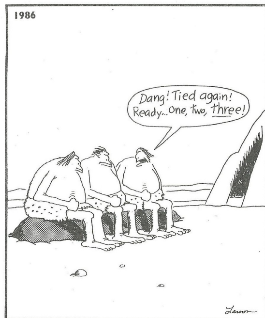
Before paper and scissors

The Office of the Harpy will not be held liable for any loss of life limb or liberty as a result of poor choices on your part...but the Harpy will most assuredly take advantage of it for ratings.