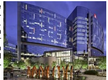
Upgrades to the facilities are obvious, both inside and outside.

The purchase marks the opening of a new Health and Drug division within Altrex, promising new jobs and a major boost to the economy.